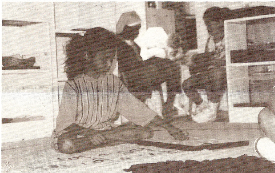
Children working at the Montessori House of Children in the US Virgin Islands