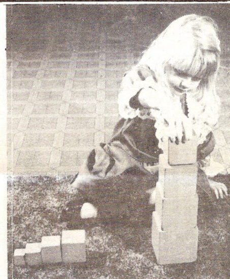
Child working with Pink Tower at the Southlake Private School (Southlake, Texas)