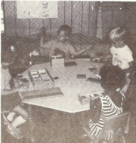
Children working at The Children's Place in Katy, Texas

Published by the International Montessori Society • 912 Thayer Ave. • Silver Spring, Md. 20910 • Phone (301) 589-1127