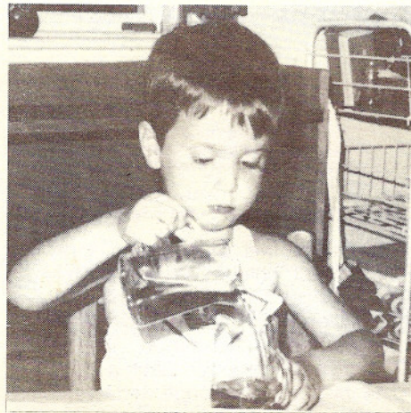
Child engaged in practical life activity at The Children's Montessori Center in Stony Brook, New York.