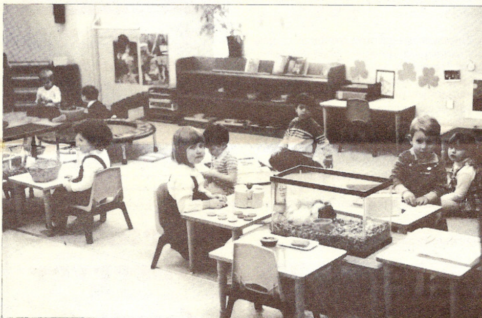
Children working at the Montessori School of Elkhart (Elkhart, Indiana)

Published by the International Montessori Society • 912 Thayer Ave. • Silver Spring, Md. 20910 • Phone (301) 589-1127