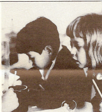
Elementary children working in classroom at the Willowbrook Montessori School (Langley Park, MD) — See article this page.

For further information about the New Zealand Montessori community, contact: New Plymouth Montessori Association, P.O. Box 392, New Plymouth, New Zealand.