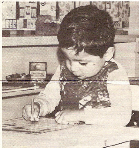
Child working in classroom at the Martin Luther King Montessori School in Ft. Wayne, Indiana. See article this page.

Published by the International Montessori Society • 912 Thayer Ave. • Silver Spring, Md. 20910 • Phone (301) 589-1127