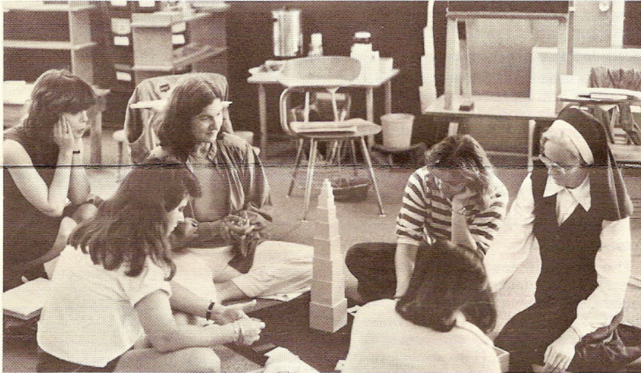
IMS Materials Workshop (Santa Rosa, CA)

Published by the International Montessori Society • 912 Thayer Ave. • Silver Spring, Md. 20910 • Phone (301) 589-1127