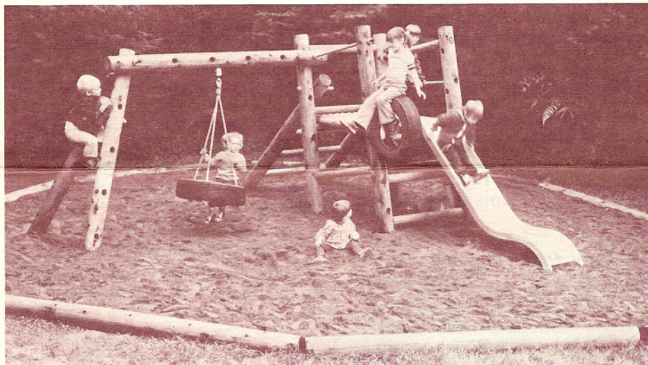
BigToys® structure, Model BY-3, 700-lbs., features include tire-swing, slidechute, climbing tire and wooden log deck.